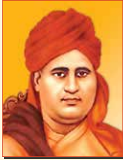
Swami Dayanand Saraswati

The founder of the Arya Samaj and the great path-maker of modern India